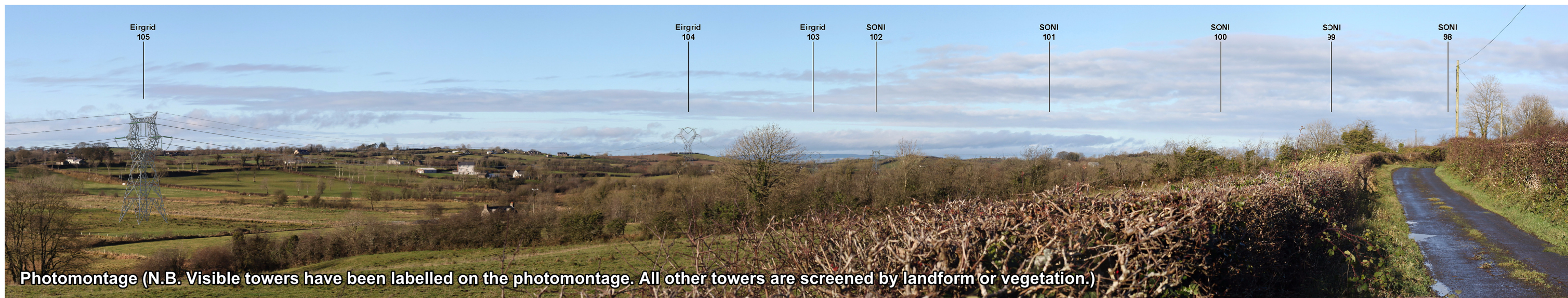
Photomontage (N.B. Visible towers have been labelled on the photomontage. All other towers are screened by landform or vegetation.)