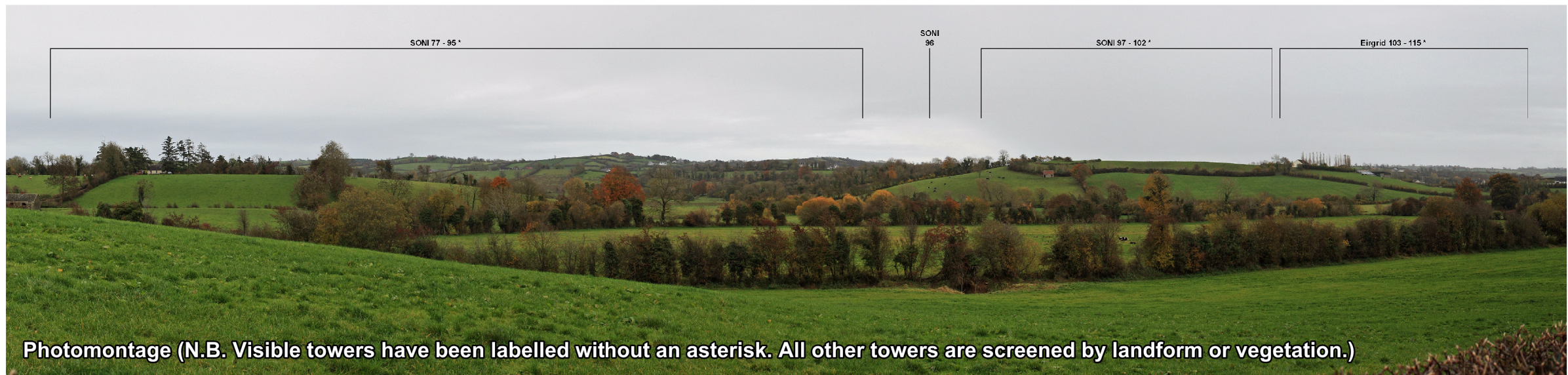
Photomontage (N.B. Visible towers have been labelled without an asterisk. All other towers are screened by landform or vegetation.)