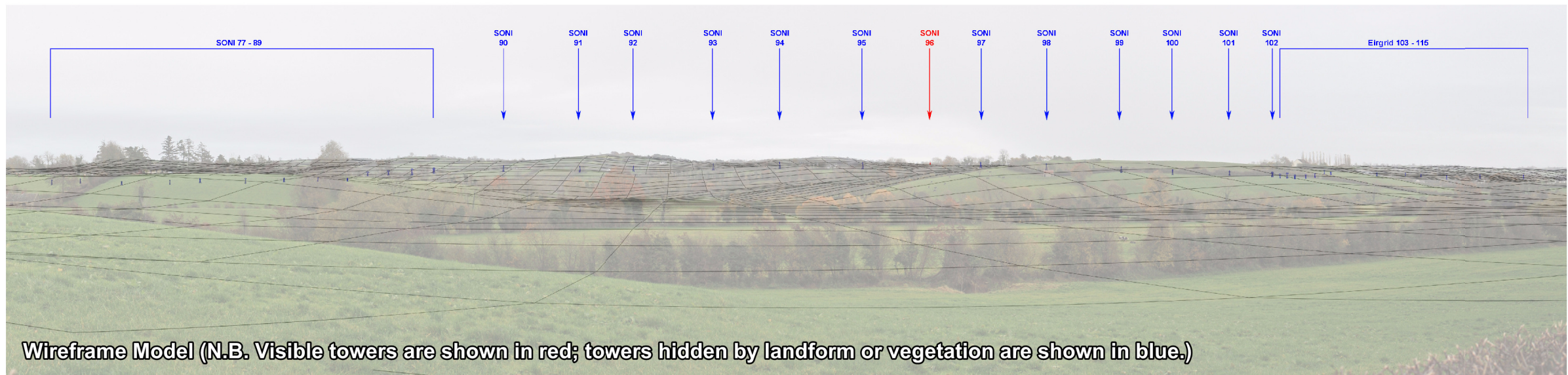
Wireframe Model (N.B. Visible towers are shown in red; towers hidden by landform or vegetation are shown in blue.)