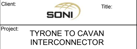
FIGURE 1.2: ADDITIONAL VISUAL RECEPTOR LOCATIONS DETAILED 500m STUDY AREA TOWERS 70-75 (SHEET 14 of 21)

This material is based upon Crown Copyright and is reproduced with the permission of Land & Property Services under delegated authority from the Controller of Her Majesty's Stationery Office, © Crown Copyright & database rights FLA213. Unauthorised reproduction infringes © Crown Copyright and may lead to prosecution or civil proceedings